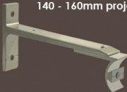
Double Base with one Adjustable Ceiling Plate 140 - 160mm projection