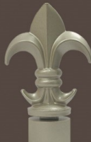
Fleur De Lis

50mm glass balls are available in: dark blue, pink, dark red, clear, clear bubble, frosted